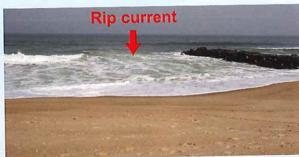
Rip currents often form near coastal structures.