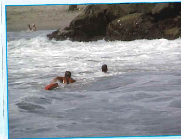
A lifeguard rescues a swimmer caught in a rip current.