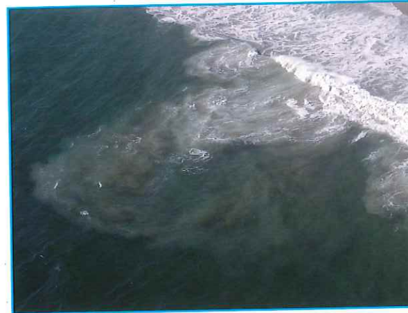
Rip currents often generate a plume of sediment moving away from shore.